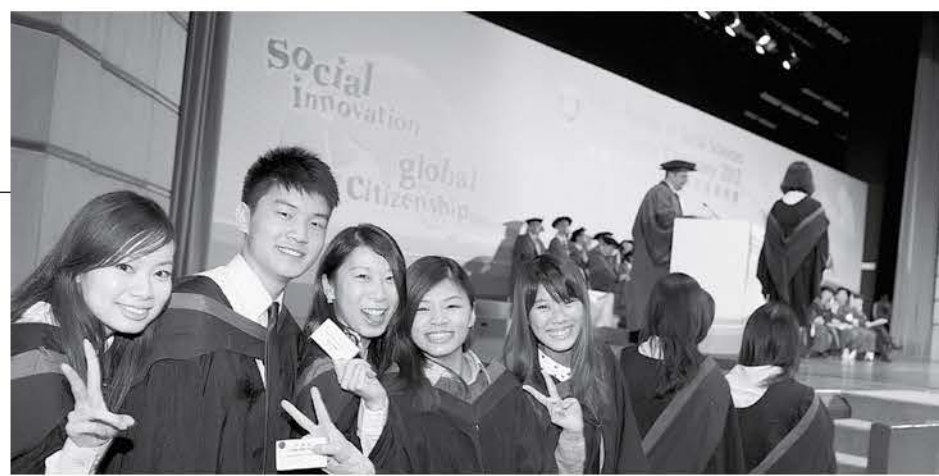
HKU opened up the public administration programme to the public in 2002, attracting a broader range of students with varied backgrounds.

government or the public can benefit from the programme, including civil servants, those working in the public sector and non-government organisations, even in public relations.