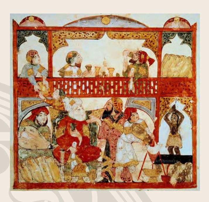
Lecture 1: The Historical Evolution of Islamic Political Thought: Law, Knowledge and Power 26 Feb 2013 (Tuesday), 6:30 – 8:30 pm

How did Shari'a develop? What is the role of knowledge in authority? In what ways had Islam been politically opportunistic? How did revelationism triumph over rationalism?